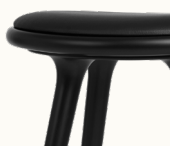
Black Stained Beech