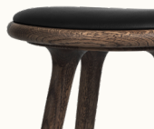
Dark Stained Oak