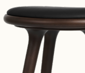
Dark Stained Beech

The High Stool is designed by the Danish architect duo Space Copenhagen and is regarded as a New Danish Classic . With its organic yet minimalist style, this stool is suitable for both residential and commercial use. The High Stool Collection is made from solid FSC® certified wood. Durable for both private and public use.