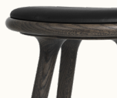
Sirka Grey Stained Oak