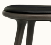
Grey Stained Beech